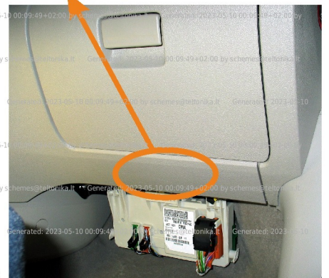
MODULE (under glove compartment - passenger's side)

trunk servo-motor brown connector 46PIN white/green pin46