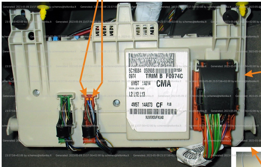
MODULE (under glove compartment - passenger's side)

CAN1 brown connector 32PIN blue pin16 CANL grey pin32 CANH brown connector 32PIN